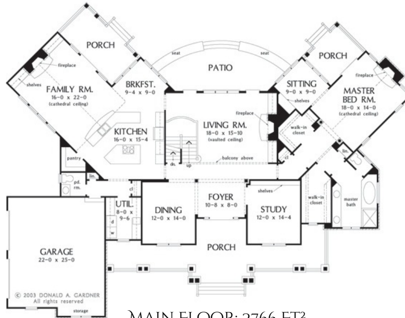
MAIN FLOOR: 2766 FT 2